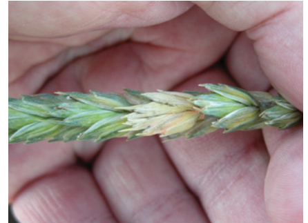
Symptoms of fusarium head blight symptoms in wheat.